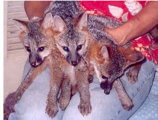
Gray foxes at 3 months old, Aug 2004